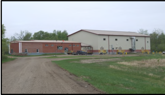
Figure 1. Water Treatment Plant #1