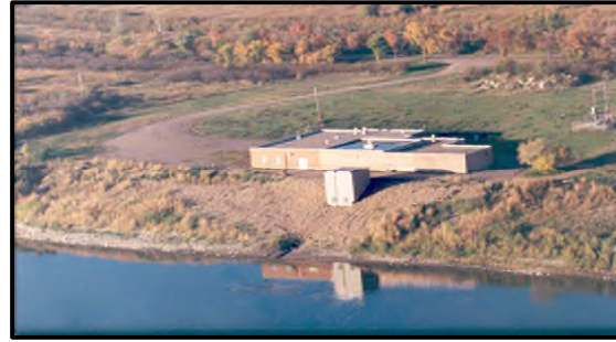
Figure 2. F.E. Holliday Water Treatment Plant

FEH WTP (Figure 2) is designated as a Class 3 Water Treatment Facility. The plant treats surface water directly from the North Saskatchewan River. Water is drawn from the river, sand is removed, and the water is treated for inorganic and organic constituents. Chlorine gas is used as the primary disinfectant with ultraviolet energy (UV) providing additional disinfection. The production capability of this plant may be affected by the turbidity of the North Saskatchewan River and sand bar formation near the plant intake.