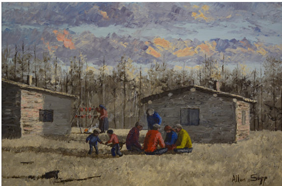
"Sun Going Down at Red Pheasant Reserve" – Allen Sapp

#1 Railway Ave East | 306-445-1760 www.allensapp.com