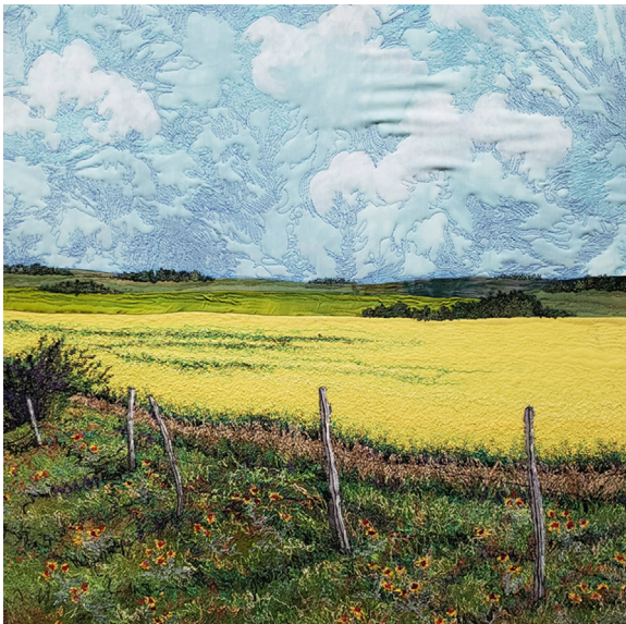
Old Posts New Crop 24x24 – Cindy Hoppe

891 - 99 th St. | 306-445-1757 www.chapelgallery.ca